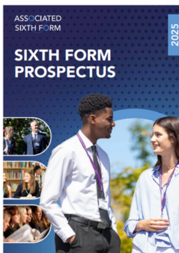
Sixth Form Prospectus