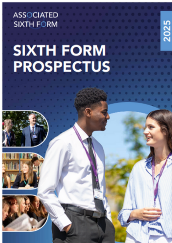
Sixth Form Prospectus